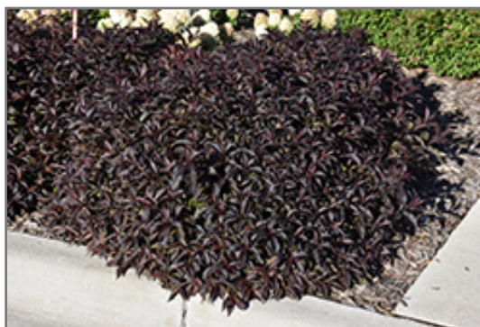
Spilled Wine Weigela