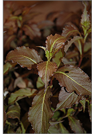
Spilled Wine Weigela foliage

This shrub should only be grown in full sunlight. It prefers to grow in average to moist conditions, and shouldn't be allowed to dry out. It is not particular as to soil type or pH. It is highly tolerant of urban pollution and will even thrive in inner city environments. This is a selected variety of a species not originally from North America.