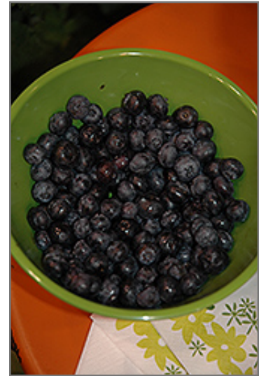
Peach Sorbet Blueberry fruit

This shrub is quite ornamental as well as edible, and is as much at home in a landscape or flower garden as it is in a designated edibles garden. It does best in full sun to partial shade. It does best in average to evenly moist conditions, but will not tolerate standing water. It is very fussy about its soil conditions and must have sandy, acidic soils to ensure success, and is subject to chlorosis (yellowing) of the foliage in alkaline soils. It is quite intolerant of urban pollution, therefore inner city or urban streetside plantings are best avoided, and will benefit from being planted in a relatively sheltered location. Consider applying a thick mulch around the root zone in winter to protect it in exposed locations or colder microclimates. This particular variety is an interspecific hybrid.