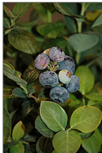
Peach Sorbet Blueberry fruit

Peach Sorbet Blueberry features dainty clusters of white bell-shaped flowers hanging below the branches in mid spring. It has green evergreen foliage. The glossy oval leaves turn an outstanding deep purple in the fall, which persists throughout the winter. It features an abundance of magnificent blue berries from early to mid summer.