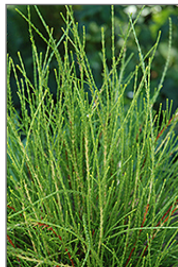
Franky Boy Arborvitae foliage