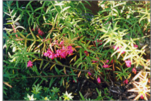
Dwarf Turkestan Burning Bush flowers

This shrub performs well in both full sun and full shade. It is very adaptable to both dry and moist locations, and should do just fine under typical garden conditions. It is not particular as to soil type or pH. It is highly tolerant of urban pollution and will even thrive in inner city environments. This is a selected variety of a species not originally from North America.