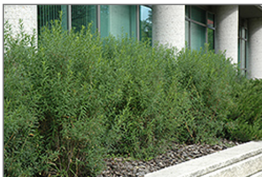
Dwarf Turkestan Burning Bush