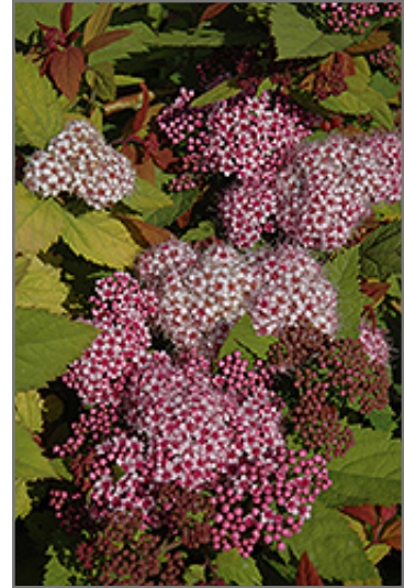
Double Play Big Bang Spirea flowers

Double Play Big Bang Spirea is recommended for the following landscape applications;