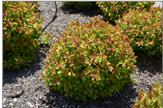
Double Play Big Bang Spirea