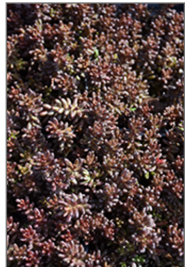
Murale Stonecrop foliage