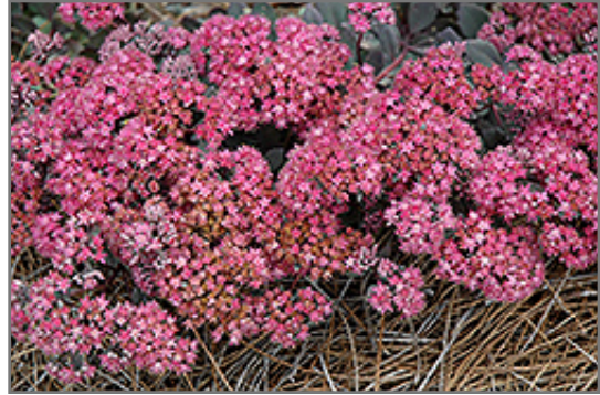
Dazzleberry Stonecrop flowers

Dazzleberry Stonecrop is a dense herbaceous perennial with an upright spreading habit of growth. Its medium texture blends into the garden, but can always be balanced by a couple of finer or coarser plants for an effective composition.