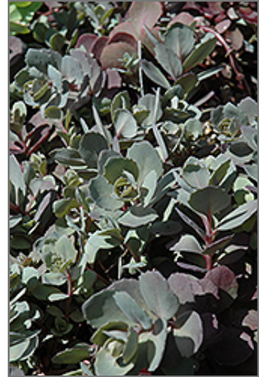
Dazzleberry Stonecrop foliage

Dazzleberry Stonecrop is a fine choice for the garden, but it is also a good selection for planting in outdoor pots and containers. It is often used as a 'filler' in the 'spiller-thriller-filler' container combination, providing a mass of flowers and foliage against which the larger thriller plants stand out. Note that when growing plants in outdoor containers and baskets, they may require more frequent waterings than they would in the yard or garden. Be aware that in our climate, most plants cannot be expected to survive the winter if left in containers outdoors, and this plant is no exception. Contact our store for more information on how to protect it over the winter months.