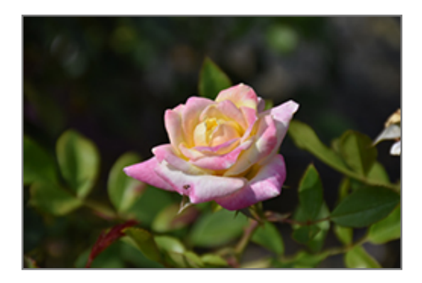
Music Box Rose flowers

A brilliantly colored variety producing blooms that are butter yellow in the center, surrounded by flashes of white and pink edges; very disease resistant; outstanding in the garden or along borders