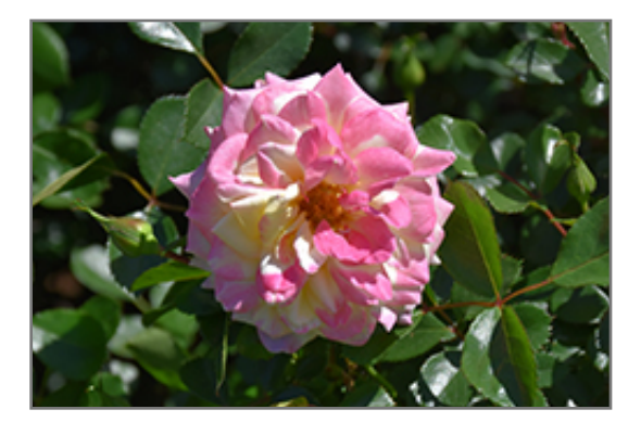
Music Box Rose flowers (faded)

Music Box Rose is recommended for the following landscape applications;