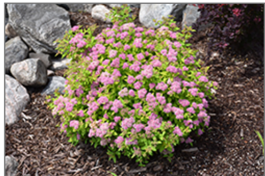
Dakota Goldcharm Spirea in bloom