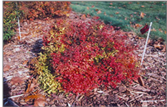
Dakota Goldcharm Spirea in fall

* This is a 'special order' plant - contact store for details