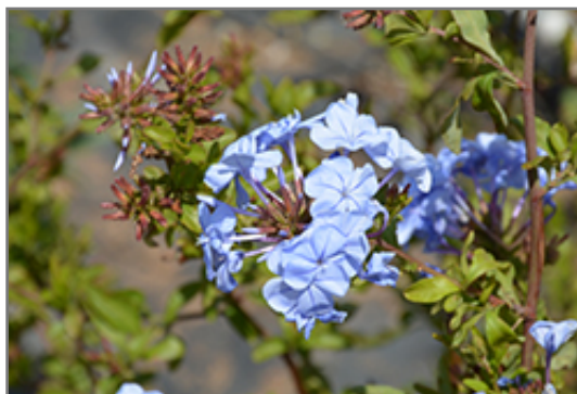
Imperial Blue Plumbago flowers

Imperial Blue Plumbago is recommended for the following landscape applications;