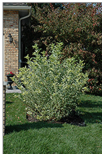
Madonna Elder