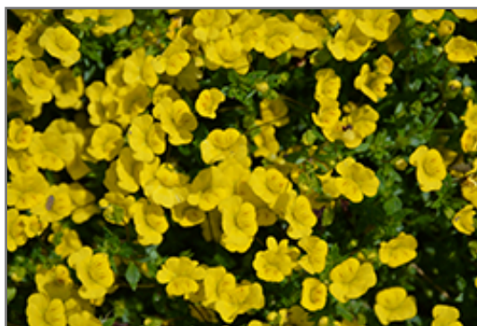
Gold Dust Mecardonia flowers