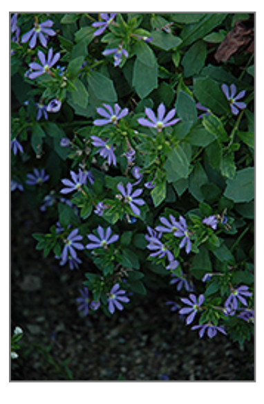
Surdiva Light Blue Fan Flower flowers