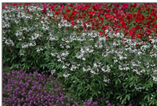
Senorita Blanca Spiderflower in bloom