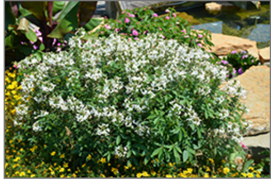
Senorita Blanca Spiderflower in bloom