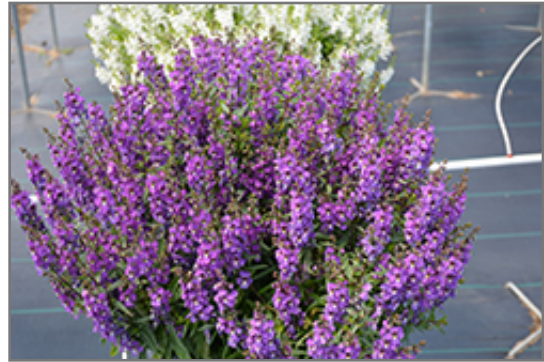
Serenita Purple Angelonia in bloom