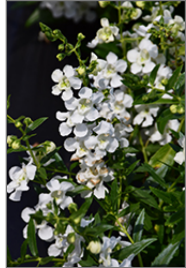
AngelMist Spreading White Angelonia flowers

AngelMist Spreading White Angelonia is an herbaceous annual with an upright spreading habit of growth. Its relatively fine texture sets it apart from other garden plants with less refined foliage.