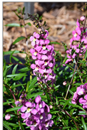
AngelMist Spreading Pink Angelonia flowers

AngelMist Spreading Pink Angelonia is recommended for the following landscape applications;