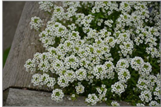
Snow Princess Alyssum flowers

Snow Princess Alyssum is recommended for the following landscape applications;