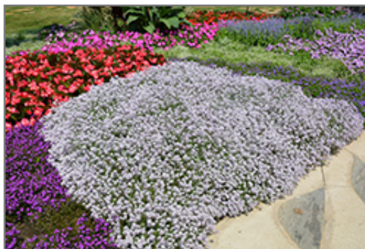
Blushing Princess Sweet Alyssum in bloom

Blushing Princess Sweet Alyssum is a fine choice for the garden, but it is also a good selection for planting in hanging baskets. Because of its trailing habit of growth, it is ideally suited for use as a 'spiller' in the 'spiller-thriller-filler' container combination; plant it near the edges where it can spill gracefully over the pot. Note that when growing plants in outdoor containers and baskets, they may require more frequent waterings than they would in the yard or garden.