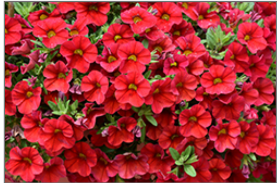
Superbells Red Calibrachoa flowers

Superbells Red Calibrachoa is recommended for the following landscape applications;