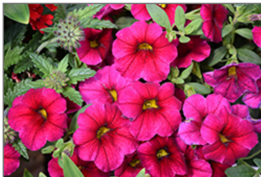
Superbells Cherry Red Calibrachoa flowers