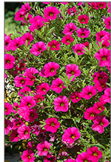
Cabaret Rose Calibrachoa flowers