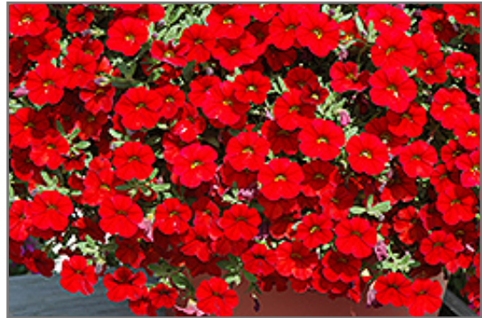
Cabaret Bright Red Calibrachoa flowers

This plant will require occasional maintenance and upkeep. Trim off the flower heads after they fade and die to encourage more blooms late into the season. It is a good choice for attracting bees and hummingbirds to your yard, but is not particularly attractive to deer who tend to leave it alone in favor of tastier treats. It has no significant negative characteristics.