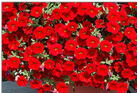
Cabaret Bright Red Calibrachoa flowers

This plant will require occasional maintenance and upkeep. Trim off the flower heads after they fade and die to encourage more blooms late into the season. It is a good choice for attracting bees and hummingbirds to your yard, but is not particularly attractive to deer who tend to leave it alone in favor of tastier treats. It has no significant negative characteristics.