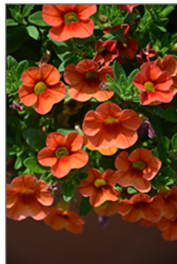
Aloha Hot Orange Calibrachoa flowers