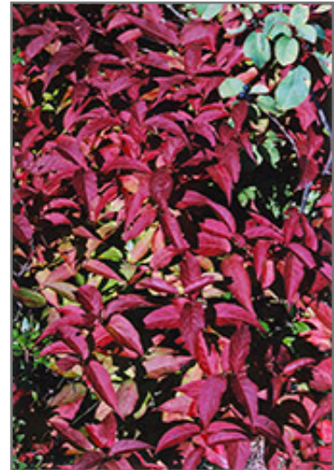
Bush Honeysuckle in fall

This shrub does best in full sun to partial shade. It is very adaptable to both dry and moist locations, and should do just fine under average home landscape conditions. It is not particular as to soil type or pH. It is highly tolerant of urban pollution and will even thrive in inner city environments. This species is native to parts of North America.