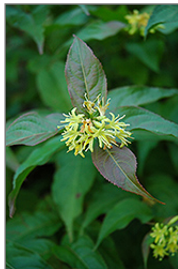
Bush Honeysuckle flowers