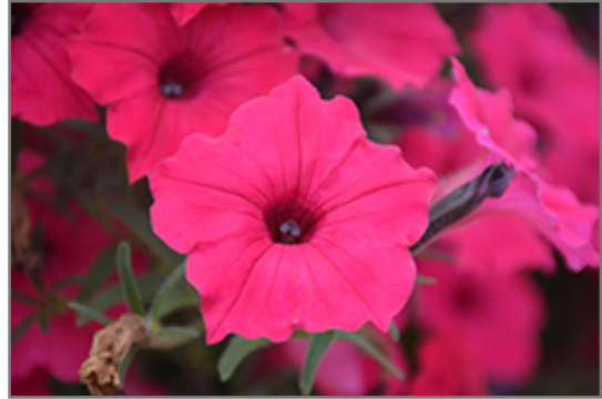
Supertunia Vista Fuchsia Petunia flowers

Supertunia Vista Fuchsia Petunia is recommended for the following landscape applications;