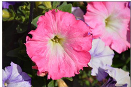
Easy Wave Rosy Dawn Petunia flowers