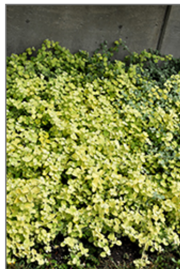
Lemon Licorice Plant