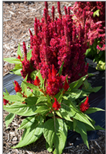
Fresh Look Red Celosia in bloom