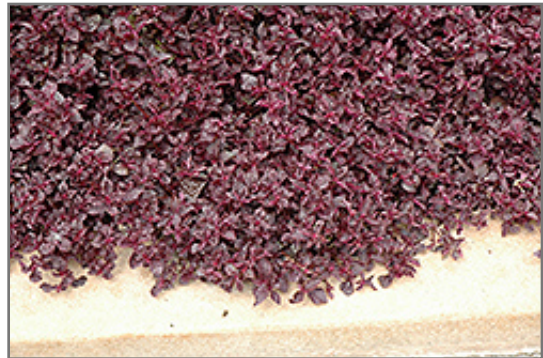
Purple Lady Blood Leaf