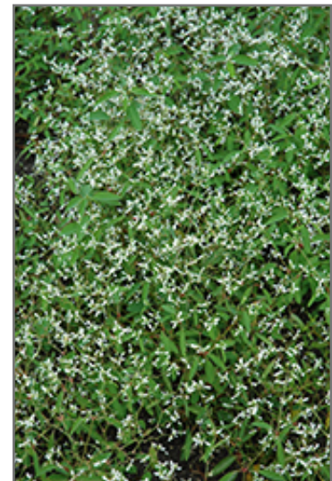
Breathless White Euphorbia flowers