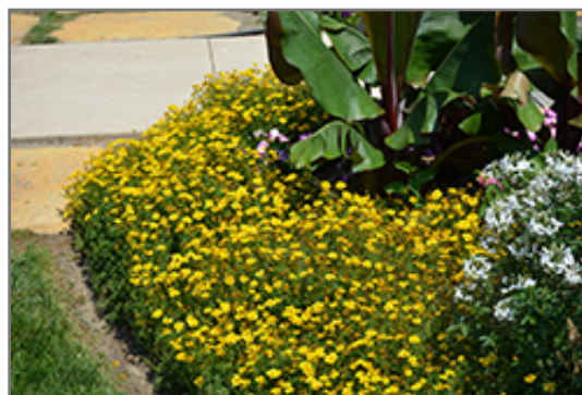
Goldilocks Rocks Bidens in bloom