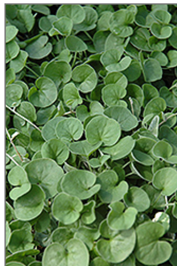
Emerald Falls Dichondra foliage