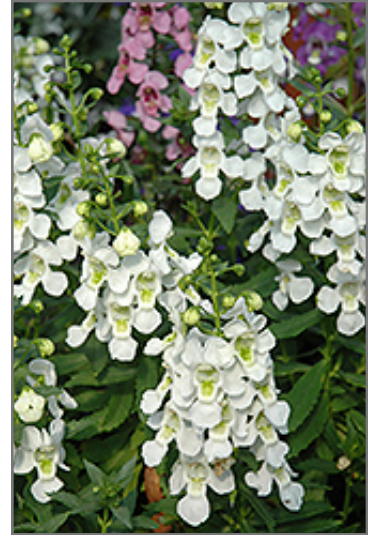
Serena White Angelonia flowers

* This is a 'special order' plant - contact store for details