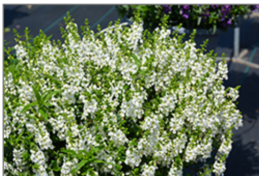
Serena White Angelonia in bloom