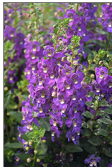
Archangel Purple Angelonia flowers

This plant will require occasional maintenance and upkeep, and should not require much pruning, except when necessary, such as to remove dieback. It is a good choice for attracting butterflies to your yard, but is not particularly attractive to deer who tend to leave it alone in favor of tastier treats. It has no significant negative characteristics.