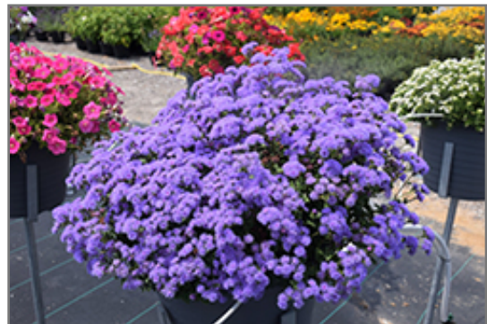
Artist Blue Flossflower in bloom