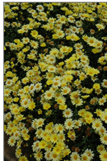
Butterfly Marguerite Daisy flowers