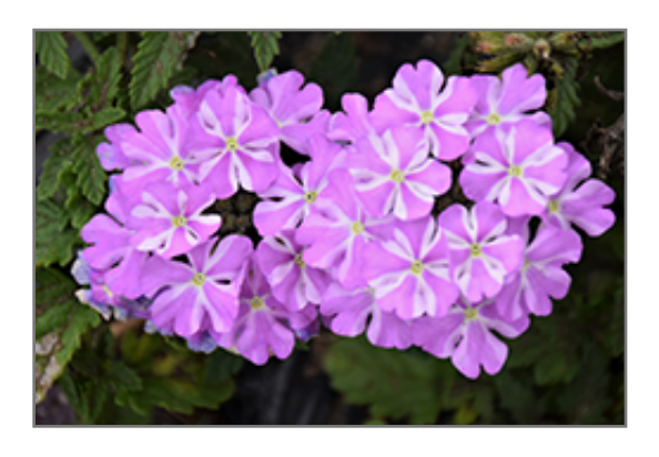
Lanai Lavender Star Verbena flowers