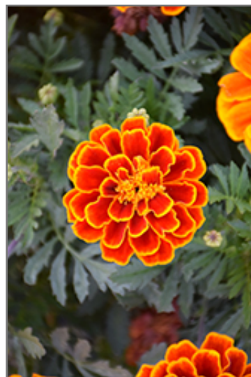
Durango Flame Marigold flowers