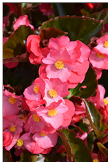
Big Rose Bronze Leaf Begonia flowers

Big Rose Bronze Leaf Begonia is recommended for the following landscape applications;