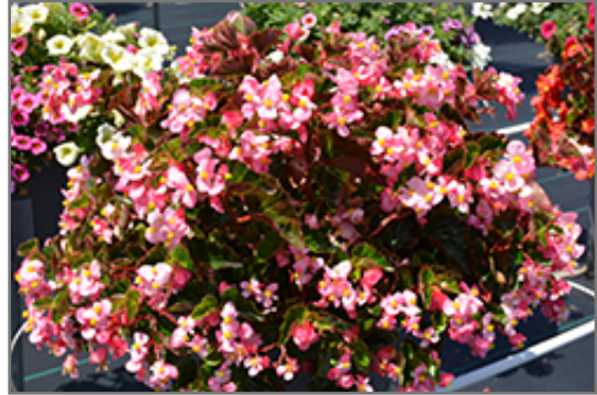
BabyWing Pink Begonia in bloom

BabyWing Pink Begonia is a fine choice for the garden, but it is also a good selection for planting in outdoor containers and hanging baskets. It is often used as a 'filler' in the 'spiller-thriller-filler' container combination, providing a mass of flowers and foliage against which the thriller plants stand out. Note that when growing plants in outdoor containers and baskets, they may require more frequent waterings than they would in the yard or garden.