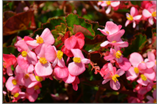
BabyWing Pink Begonia flowers

This is a high maintenance plant that will require regular care and upkeep, and usually looks its best without pruning, although it will tolerate pruning. Deer don't particularly care for this plant and will usually leave it alone in favor of tastier treats. Gardeners should be aware of the following characteristic(s) that may warrant special consideration;