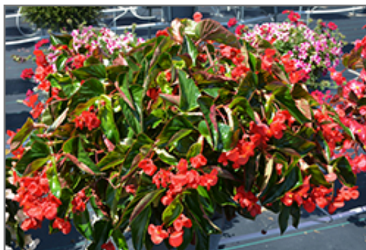
Dragon Wing Red Begonia in bloom