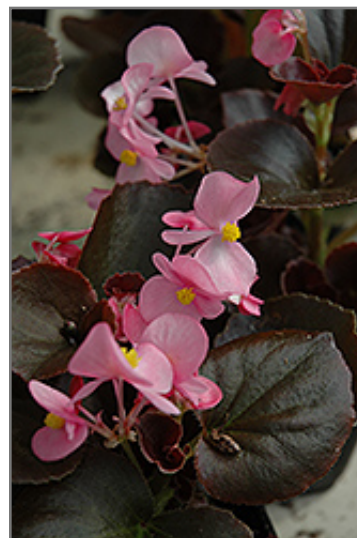
Cocktail Gin Begonia flowers