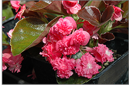
Doublet Rose Begonia flowers