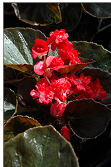
Doublet Red Begonia flowers