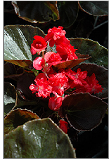
Doublet Red Begonia flowers