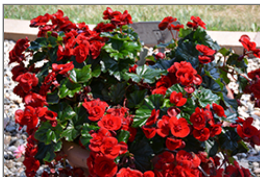
Solenia Velvet Red Begonia in bloom