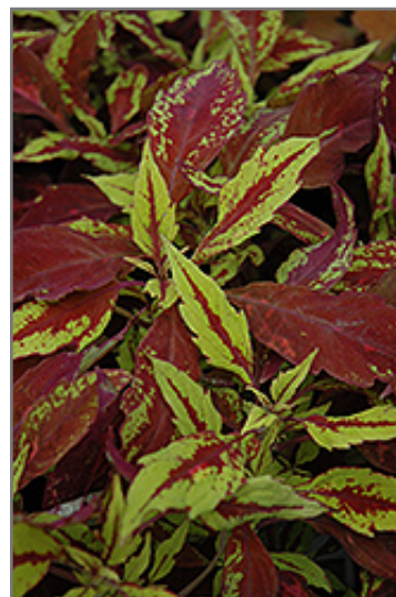
Pineapple Coleus foliage