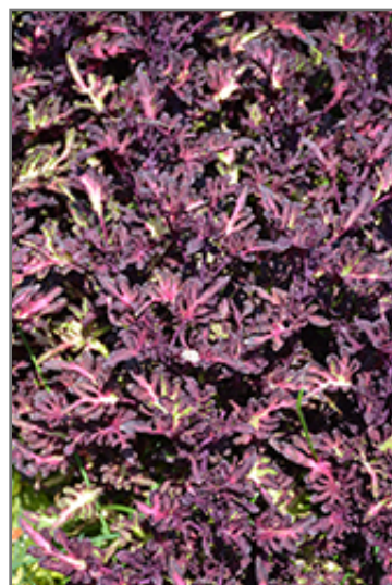
Merlin's Magic Coleus foliage