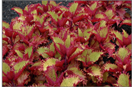
Henna Coleus foliage