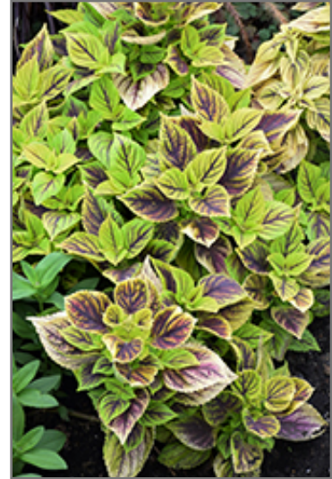
Gays Delight Coleus